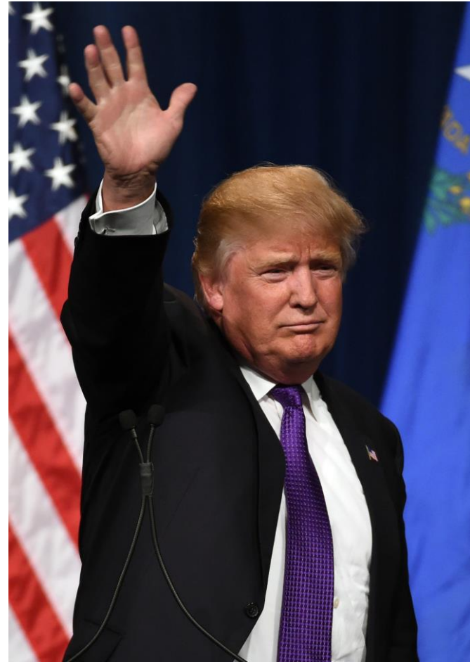
LAS VEGAS, NV - FEBRUARY 23: Republican presidential candidate Donald Trump waves after speaking at a caucus night watch party at the Treasure Island Hotel & Casino on February 23, 2016 in Las Vegas, Nevada.

World Youth Day, Krakow, Poland Pope Francis will visit Krakow, the Marian shrine of Czestochowa, Auschwitz and the meadows of Brzegi, where he will celebrate Mass with over two million young people.