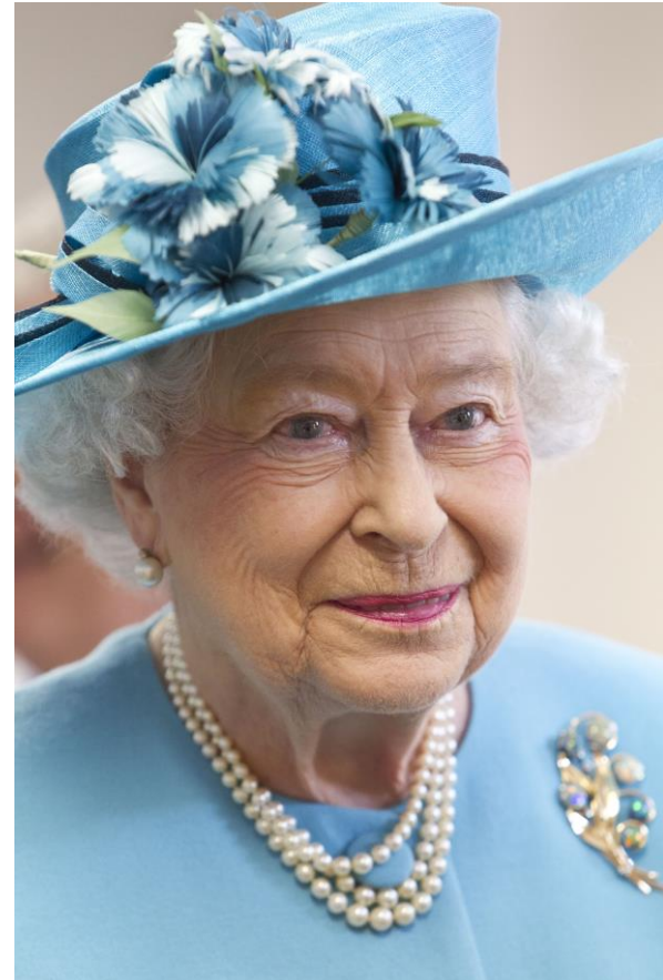
CHADWELL HEATH, ENGLAND - JULY 16: Queen Elizabeth II during a visit to Chadwell Heath Community Centre on July 16 in Chadwell Heath, United Kingdom.

England plays host to the Rugby World Cup. 20 nations will compete for the Webb Ellis Cup, with New Zealand the strong favourites.